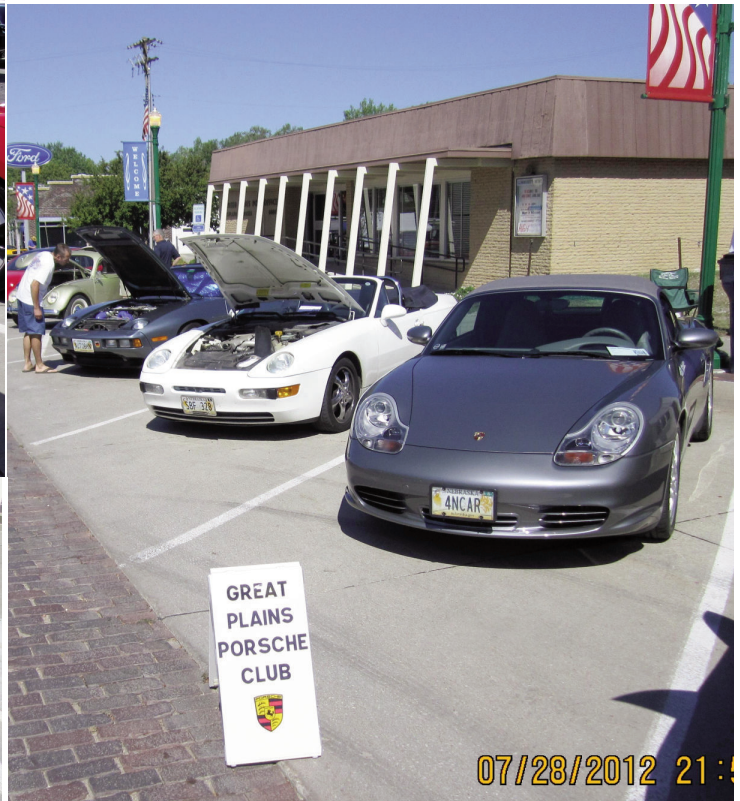
Porsches and VWs competed at the Ashland Auto Show. The 1954 Beetle on the left finished third.

Superior Chemistry. Superior Performance.