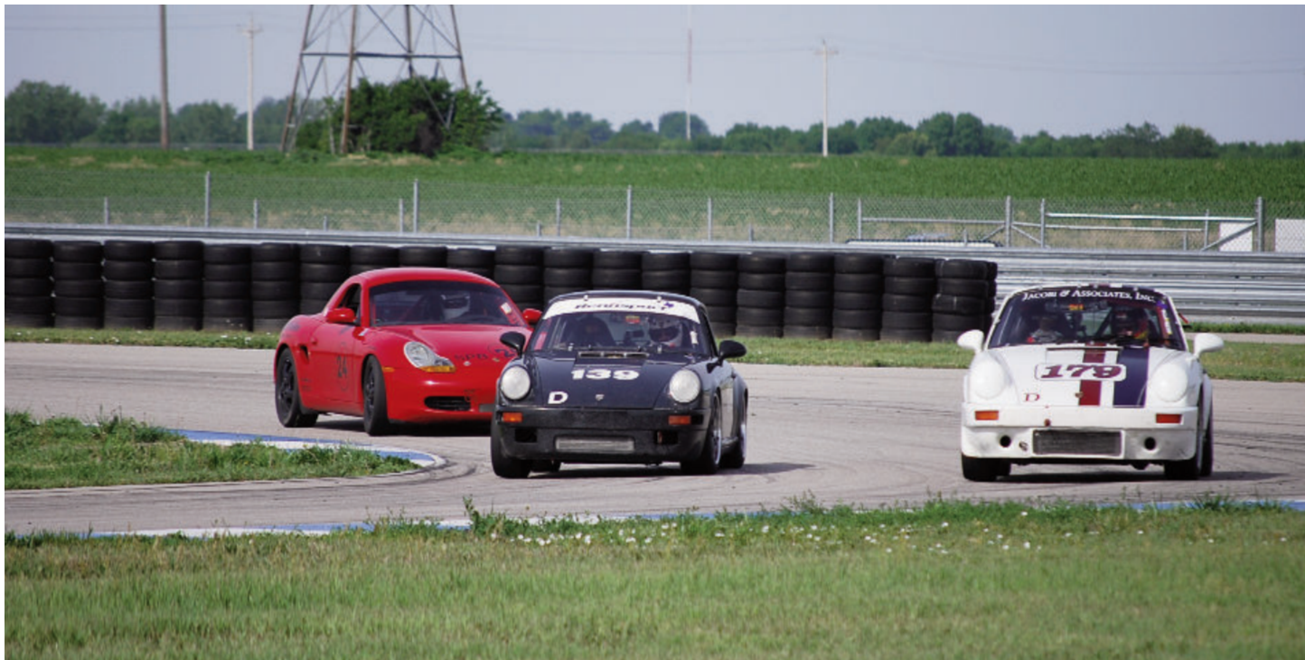
Club Racers round the final turn to the finish line at the Carrera GT at Motorsports Park Hastings.

The weekend of June 1 through 3, the GPR hosted the Carrera GT at Motorsports Park Hastings PCA Club Race. The PCA Club Racing program allows PCA members to exercise their driving skills in a more competitive environment than the Drivers Education program.