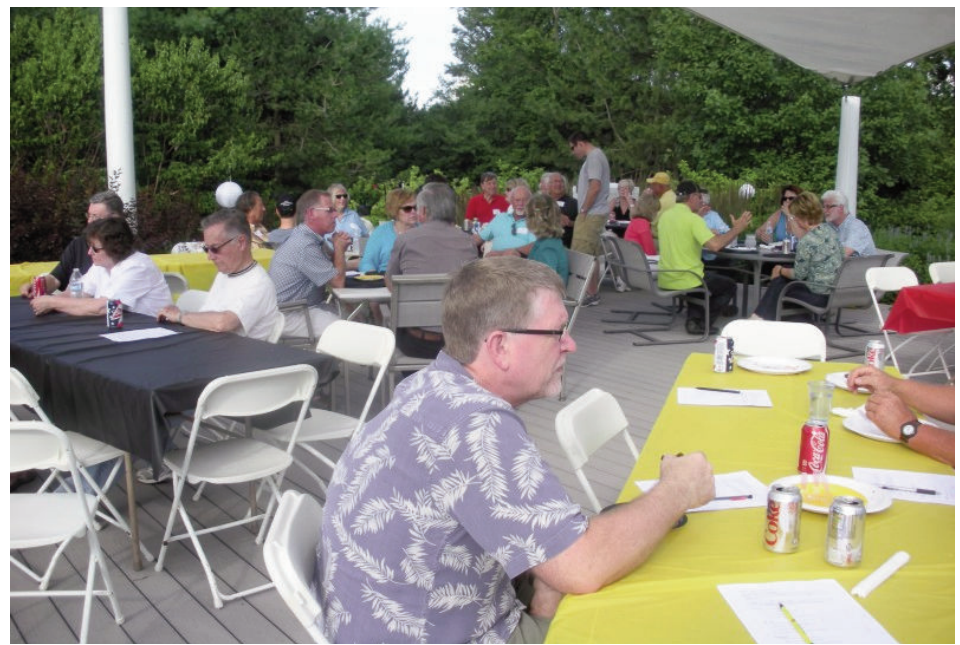
These GPR members enjoyed the "adult" atmosphere of the Solstice Soiree. The Steak Fry will be more "family freindly".

This is a family event, so plan to bring the kids. You won't want to miss it. Watch this space next month for more details.