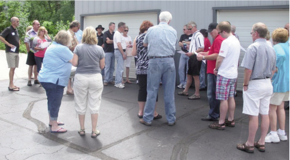
GPR members prepare for the quiz at the Solstice Soiree

All in all, the first Solstice Soiree was a great success. Those in attendance hope it becomes an annual affair. If so, you won't want to miss it next year!