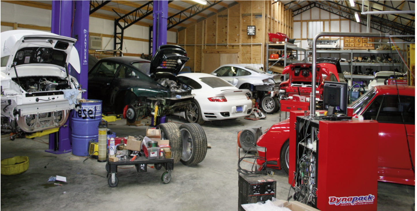
Promotive's garage may be in the middle of nowhere, but provides excellent tuning services for your Porsche.

For those who have followed my past columns, you'll know that, a couple years ago, I decided to swap out my Boxster's engine for one from a 1999 996. It has been quite a process – after the initial swap, I was not happy with the exhaust sound, so last year I installed a Fabspeed. I also noticed last year that the car just didn't have quite as much power and torque as it should.