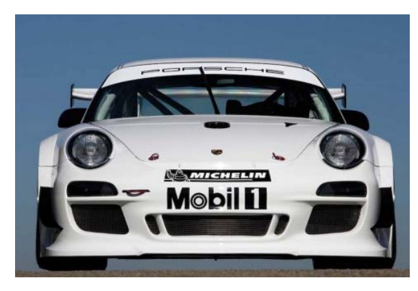
Porsche's latest racecar, the GT3 R, which sports a 4.0 liter, 480 HP engine, will replace the GT3 Cup Car model in future FIA GT3 races. If you'd like one, they will be released in spring of 2010 with a list price of $415,000.

PRSRT STD US POSTAGE PAID OMAHA, NE PERMIT NO. 1313