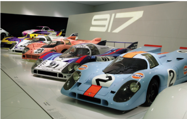
917s on display at the Porsche Museum in Stuttgart.