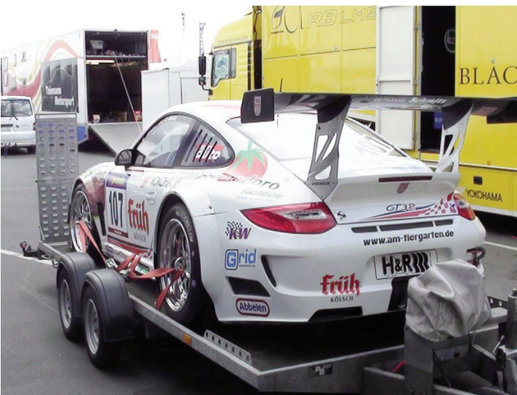
The Sabine Schwarz GT3R loading in the paddock at the Nurburgring.