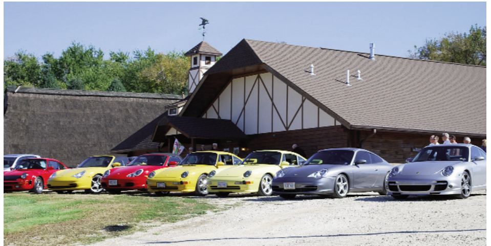
German excellence old and new in Manning, Iowa.

want to have a nice drive and see something that is very interesting you take a drive to Manning, Iowa. You will not be disappointed. The website is www.germanhausbarn.com for more information.