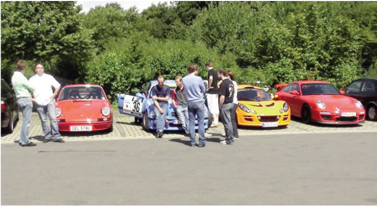
Old and new Porsches at the Nurburgring.