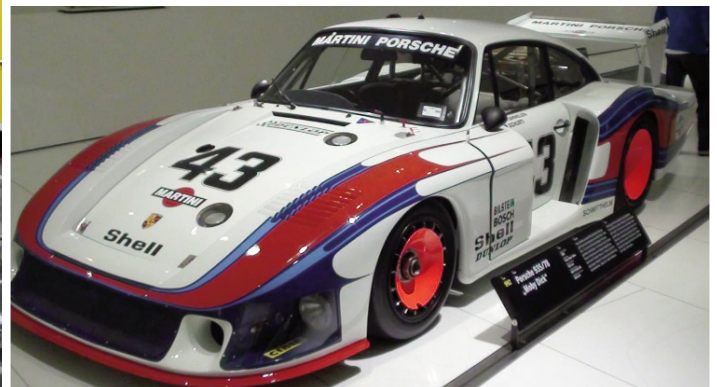
\A 935 in the famous Martini Racing colors.