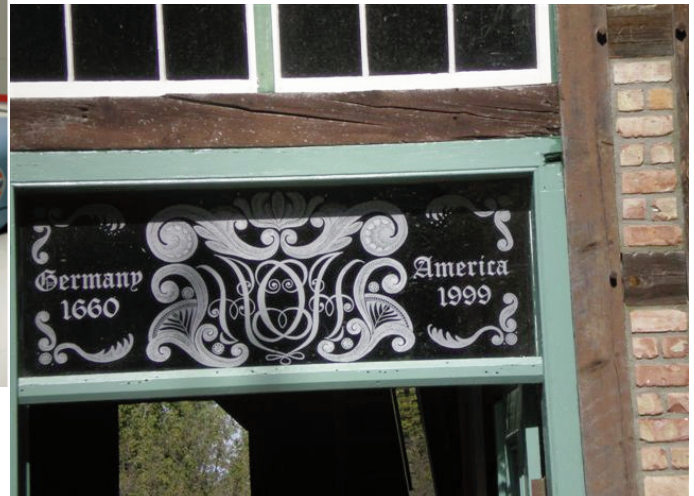
The Hausbarn was first erected in 1660 in Germany and then meticulously moved to Iowa in 1999.