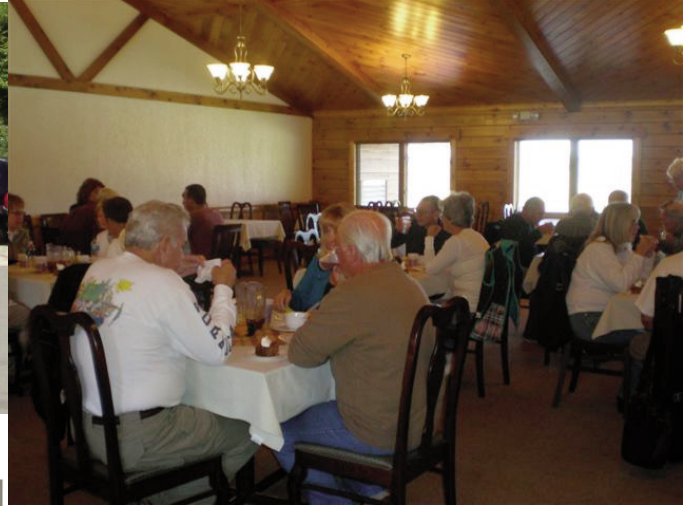
Enjoying a meal together at the Hausbarn.