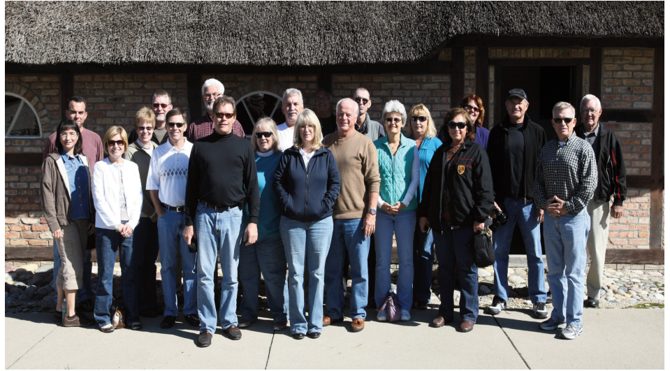
GPR members posed in front of the Hausbarn following their informative tour.