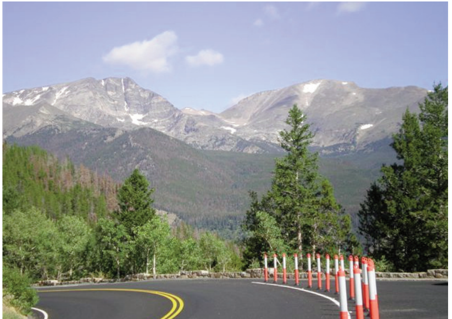
Colorado's Highway 36 is one of the great Porsche roads in America.

The weather was perfect and we had a great time. I suggest if you have never been over Trailridge Road (Highway 36 out of Estes Park) or if it has been a while since you have driven it in a Porsche take my advice: it is well worth it.