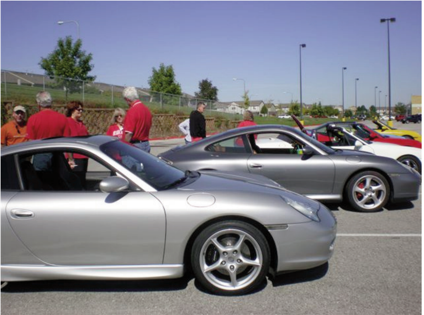
The Porsche poker players gather for the start of the 2011 Great Plains Poker Run in Omaha.