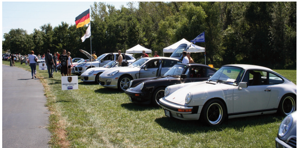
Over 1000 spectators enjoyed viewing automotive art amongst the flowers.

participants over 20 different marques were represented. Among them were Ferrari, Lamborghini, Alfa Romeo, Mercedes-Benz, Fiat, BMW, Volkswagen, Maserati, Audi, MG, Triumph, Austin Healy,