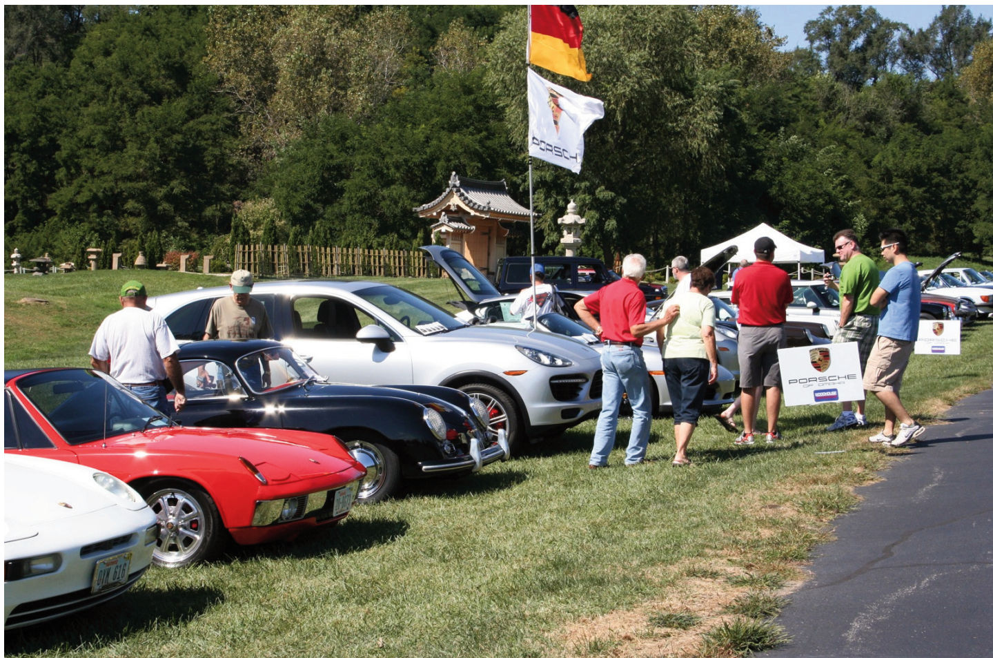
25 Porsches of all eras and models graced the Lauritzen Gardens All Euro Car Show.

stunning automobiles and even better camaraderie. Do not miss this event next year!