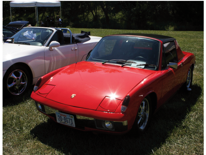
Beautiful examples of some of Porsches finest gleam in the sun and fun of the Lauritzen Gardens.

It was a celebration of everything that is exciting and exhilarating about the world's finest automobiles. An exhibition of the best for those who truly appreciate the art, engineering, and performance of European automobiles.