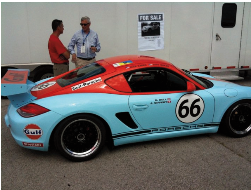
Last chance for a GPR Driver's Ed event this year is at Mid America Motorplex.