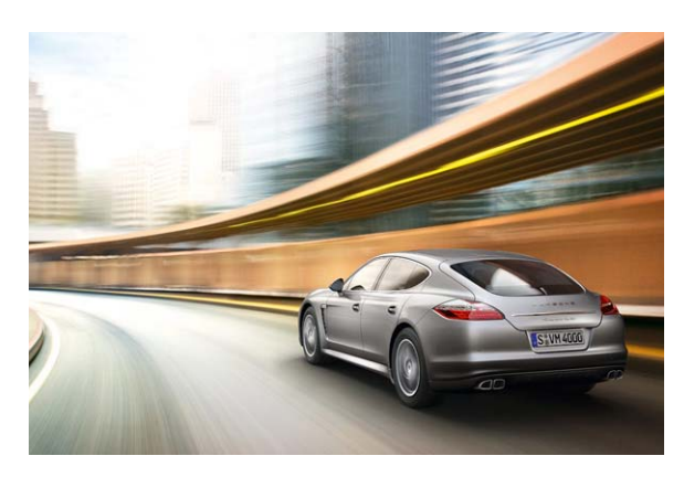
The Panamera will officially be introduced by Woodhouse in two upcoming events. Details for both events are below.

PRSRT STD US POSTAGE PAID OMAHA, NE PERMIT NO. 1313