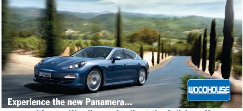
with your Woodhouse family at the Salisbury House.

Woodhouse will be holding two upcoming Panamera unveilings.