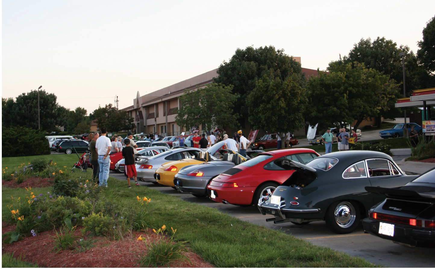
Porsches were well-represented at the final Sonic Show 'n' Shine Cruise Nite of 2011

On August 27, the weather was perfect and the conversation was better! Nearly 100 cars rolled out to Sonic for the last Show 'n' Shine Cruise Nite of the season. It was a sea of European cars with Porsches, BMWs, Audis, Ferraris, Volkswagens, and even a handful of Chevy Corvairs pretending to be European