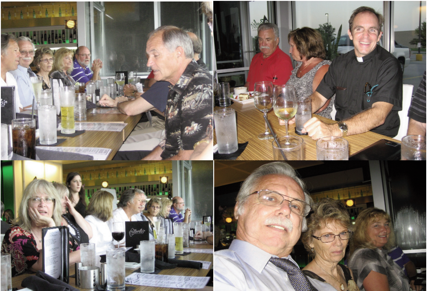
20 Great Plains Region members met for dinner, drinks, and fellowship at Zurlos Italian Bistro

The GPR held another excellent and well-attended dinner event on July 16 at Zurlos Italian Bistro.