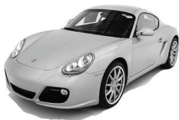
2011 Cayman S #S110074

Lease for only $899 per month* 320 hp, PDK, mid-engine handling, incredible design