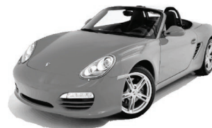
2011 Boxster PDK #S110097

Lease for only $899 per month* 320 hp, PDK, mid-engine handling, incredible design