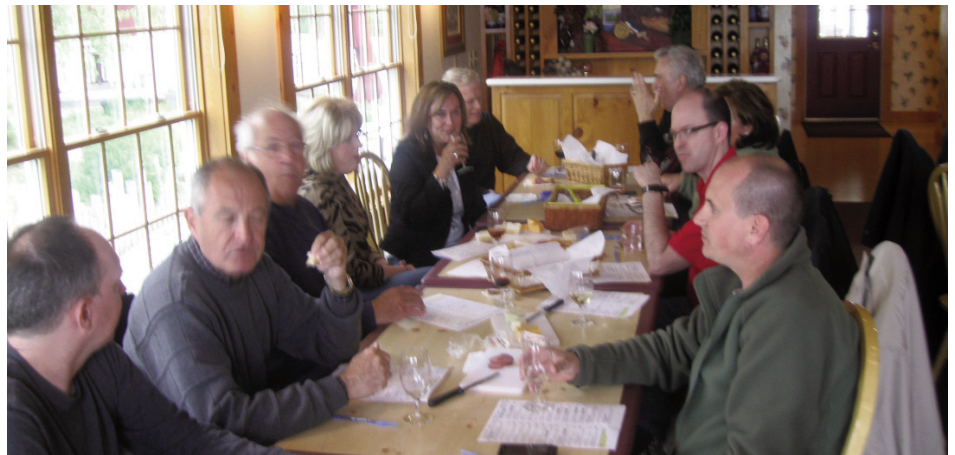
Inside, the vineyard offered a comfortable place to enjoy excellent cheese, sausage, bread, and maybe a little wine.

are refraining from printing pictures of the author in questionable head gear.) We ended the night with a nice ride back to Omaha. I think I speak for all that attended when I say a good time was had by all.