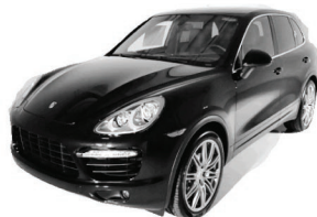
2011 Cayenne Voted Motor Trend SUV of the year. Come experience the best handling SUV available. Starting at $50,200

Lease for only $699 per month* 3 in stock today at this price