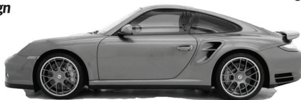
2011 911 Turbo S #S110123

530 hp, All Wheel Drive, PDK, PCCB, 0-60 mph in 3.1 seconds