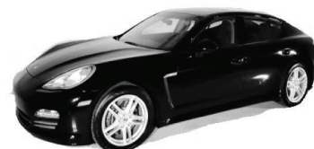
2011 Panamera 4 The four seat luxury All Wheel Drive sedan, 300 hp Starting at $78,900