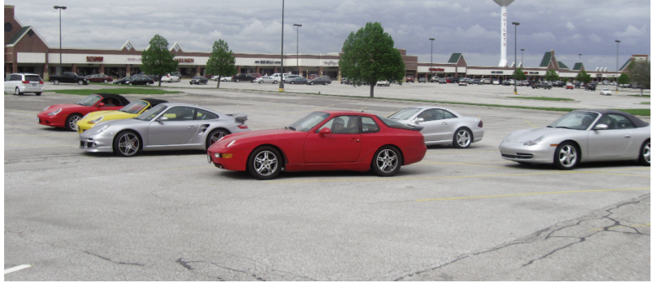
The skies were overcast, but 11 members in six cars gathered in Gretna for the James Arthur Vineyards Fun Run.

So, off we went on an impromptu ride to the Ding-a-Ling for a few more drinks, food, laughter, and conversation. ( Ed. Note: In an effort to stay family friendly, we