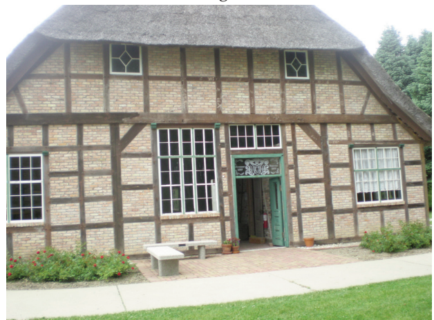
The next Fun Run will be July 18 to the Hausbarn, Historic Farm, and Church in Manning, Iowa.