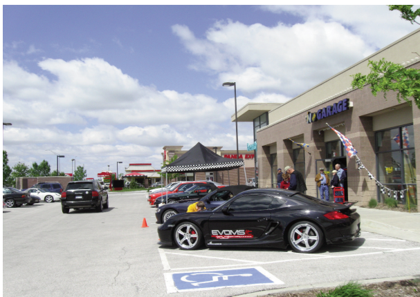
In the Garage hosted a number of Porsches (and other makes) in May.

Please show up with your Porsche and a full tank of gas. There is only one other Hausbarn in the United States. You can learn more at www.germanhausbarn.com .