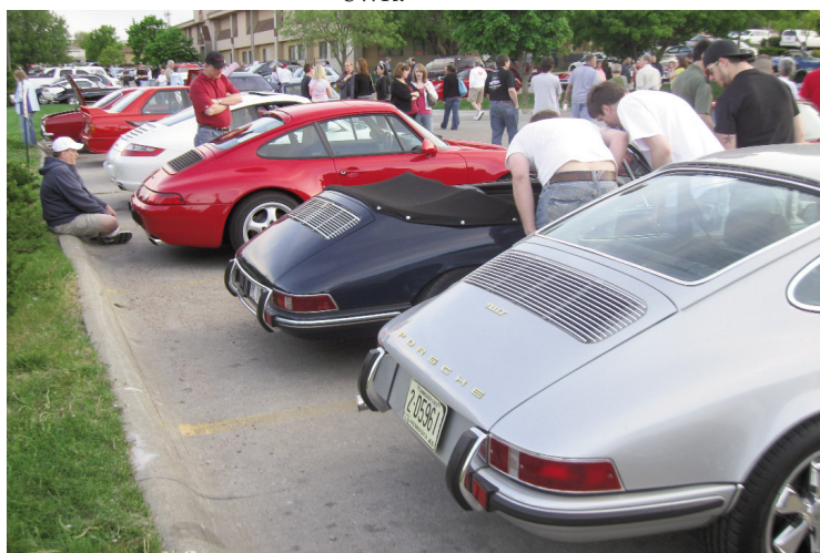
An excellent crowd turned out for the first Sonic Show 'N' Shine Cruise Night of 2010