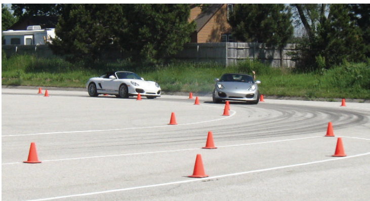
Professional drivers on a closed course. Smiles all around.