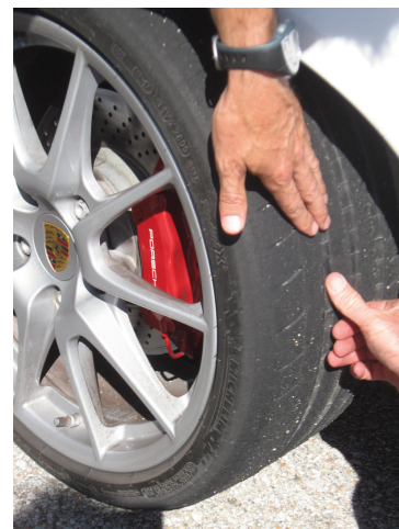
These were new tires at the start of the day.