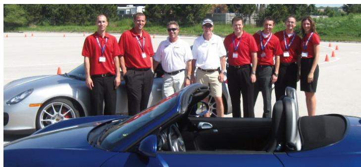
The Woodhouse crew poses with the Porsche Sport Driving School Instructors at the autocross course.

All of the club members present had smiles on their faces as they got out of the cars. The GPR would like to thank Woodhouse Porsche of Omaha for sponsoring the event. If you missed this year, be sure to put it on your calendar the next time it comes around!