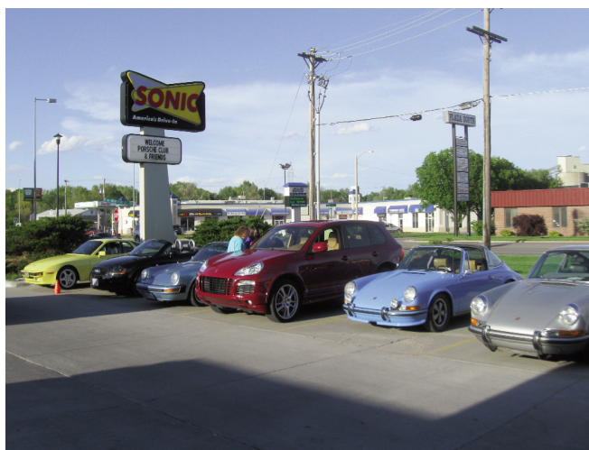
Something old, something new, all of them fast, and something blue.

The neon nostalgia of Show 'N' Shine Cruise Nites, has been serving up big fun to thousands of enthusiasts for 16 years. Join us for the half price food, fun, sights, and sounds. Great food, great friends, and memories to last a lifetime! Make some of your own.