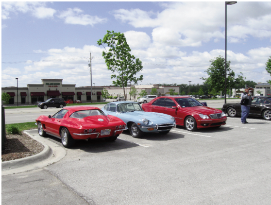
Along with Porsche and BMW club members, Corvette, Jaguar, and Mercedes owners learned about car care at In the Garage.

PRSRT STD US POSTAGE PAID OMAHA, NE PERMIT NO. 1313