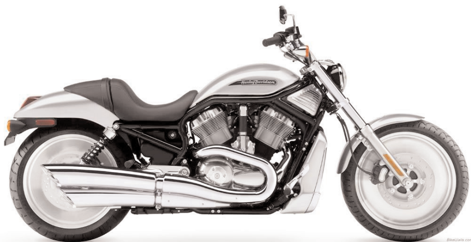
Harley riders are almost as fanatical about their rides as Porsche drivers are about thier cars.

Option Four: Take a bus to the factory on Friday morning. Take the tour. Have lunch and/or dinner together. Stay overnight at the plaza. The women can shop and the men can find a sports bar or whatever.