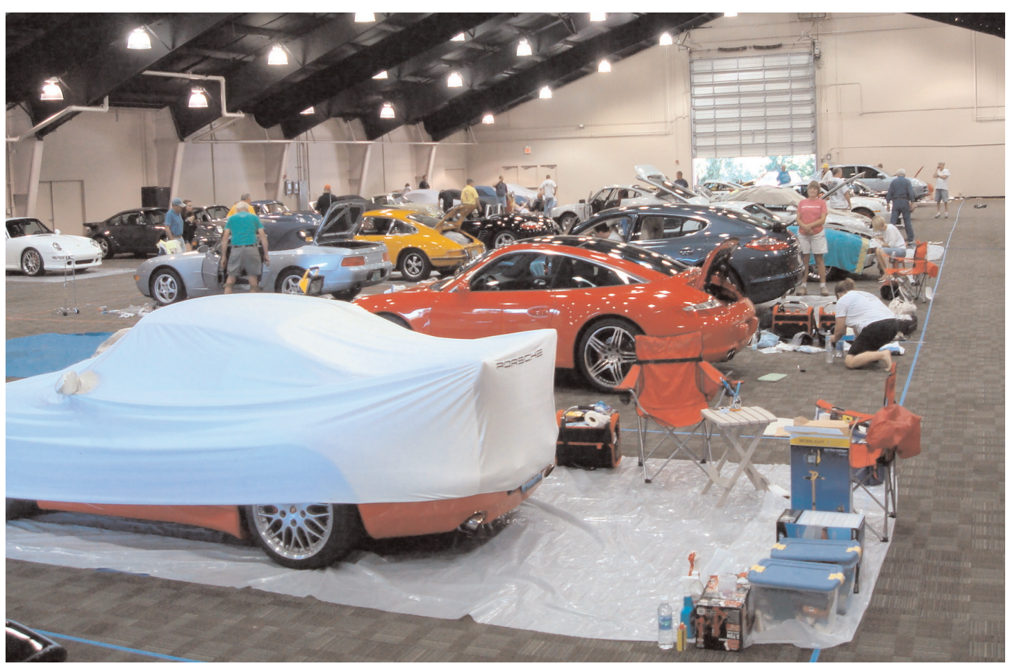
Prior to the actual concours, participants spend hours getting their Porsches just right.

Concours event of the year for PCA; a truly awesome display of over 60 years of Porsche history in America and beyond. The Parade location this year is Savannah, Georgia, a charming destination city that is sure to provide you with your fill of pralines and peanuts once you have had enough of the Concours.