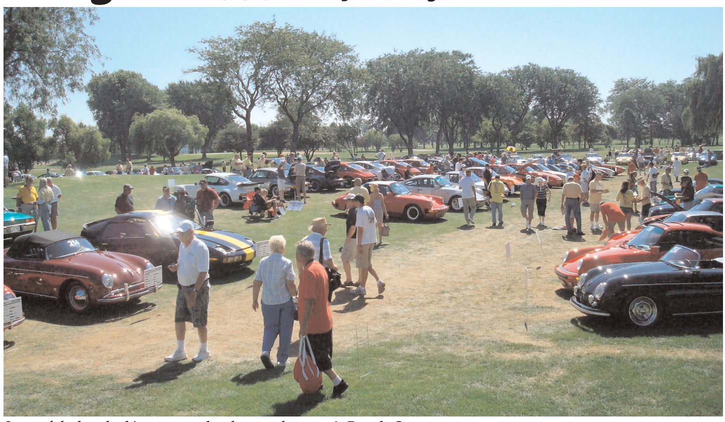
Some of the best looking cars on the planet at last year's Parade Coucours

That title question really seems to be the most common thing asked by new Parade attendees...what is this Concours thing all about? Well, I guess it might be considered one of those questions where the answer depends on your perspective. If you have an autocross perspective, then the "Q-tippers" are slightly off