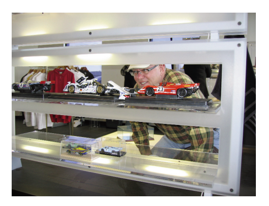
Get ready to show your Porsche memorabilia at Woodhouse Porsche on March 20. See page 8.

PRSRT STD US POSTAGE PAID OMAHA, NE PERMIT NO. 1313