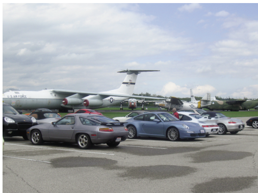
Porsches and planes at the National Museum of the United States Air Force

PRSRT STD US POSTAGE PAID OMAHA, NE PERMIT NO. 1313