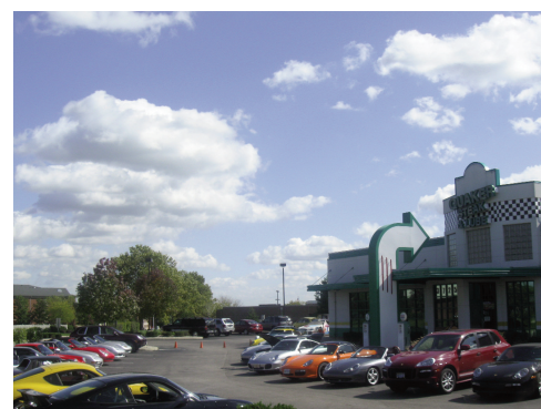
The largest gathering of Porsches at the Escape was at Quaker Steak and Lube